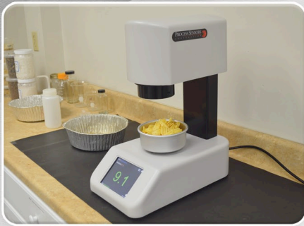
Low fat potato chips