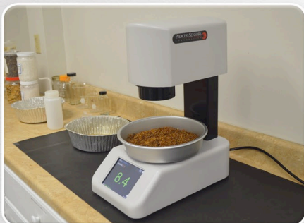
Moisture in tobacco