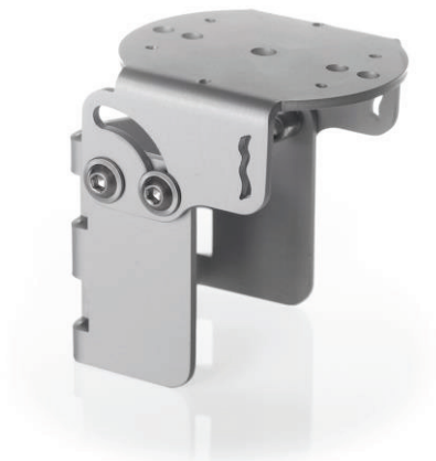
Figure 5 PMF01 mounting fixture accessory: practical, small footprint, and allowing horizontal and vertical plane of array installations on various platforms