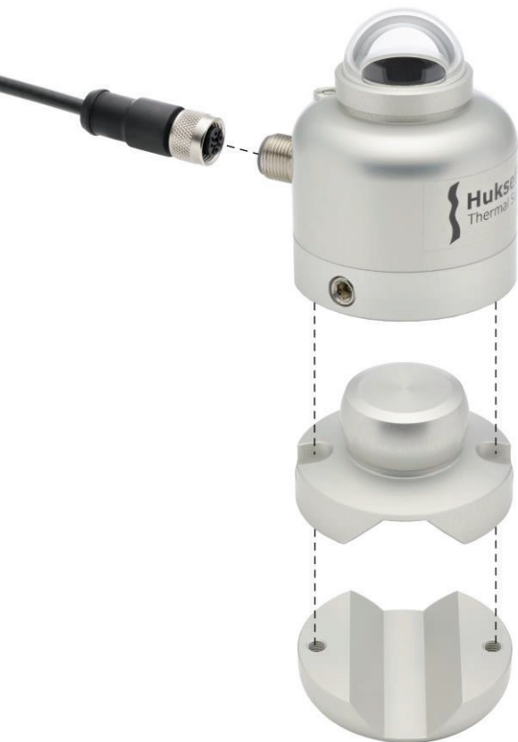
Figure 3 'Exploded view' of SR05-D1A3-PV. The optional ball levelling and tube mount allow for easy installation. The cable (standard 3 m) has an M12-A connector.

SR05 pyranometers employ a thermopile sensor with black coated surface, one dome and an anodised aluminium body with visible bubble level. Optionally the sensor can be delivered with a unique ball levelling mechanism and tube mount or dedicated mounting fixture, for easy installation. SR05-D1A3-PV has an industry standard digital output: Modbus RTU over half-duplex RS-485, that allows multiple sensors to be installed on a single network. In addition, SR05-D1A3-PV has analogue 0-1 V output.