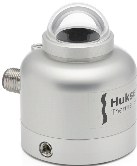
Figure 1 SR05-D1A3 -PV pyranometer

SR05 series is the most affordable range of pyranometers meeting ISO 9060 requirements. These sensors are ideal for general solar radiation measurements and popular for monitoring PV systems. Model SR05-D1A3-PV is made as a perfect alternative to PV reference cells. It offers the same Modbus interface as the most common PV reference cell model for easy compatibility. Relative to PV reference cells, SR05-D1A3-PV has the advantage of higher stability, independence of the PV cell type or anti-reflection coating, and better availability and price of recalibration.