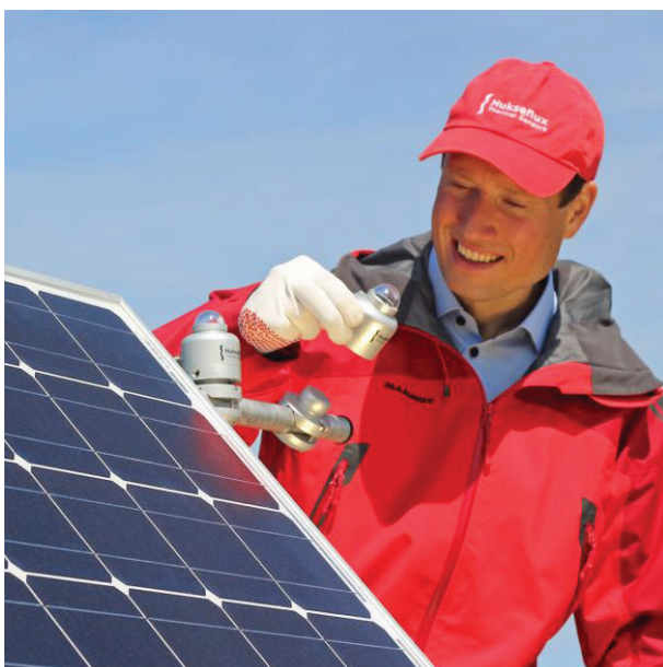
Figure 2 SR05's, one in PoA, replacing PV reference cell